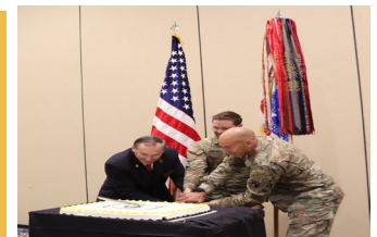
249 th Army Birthday