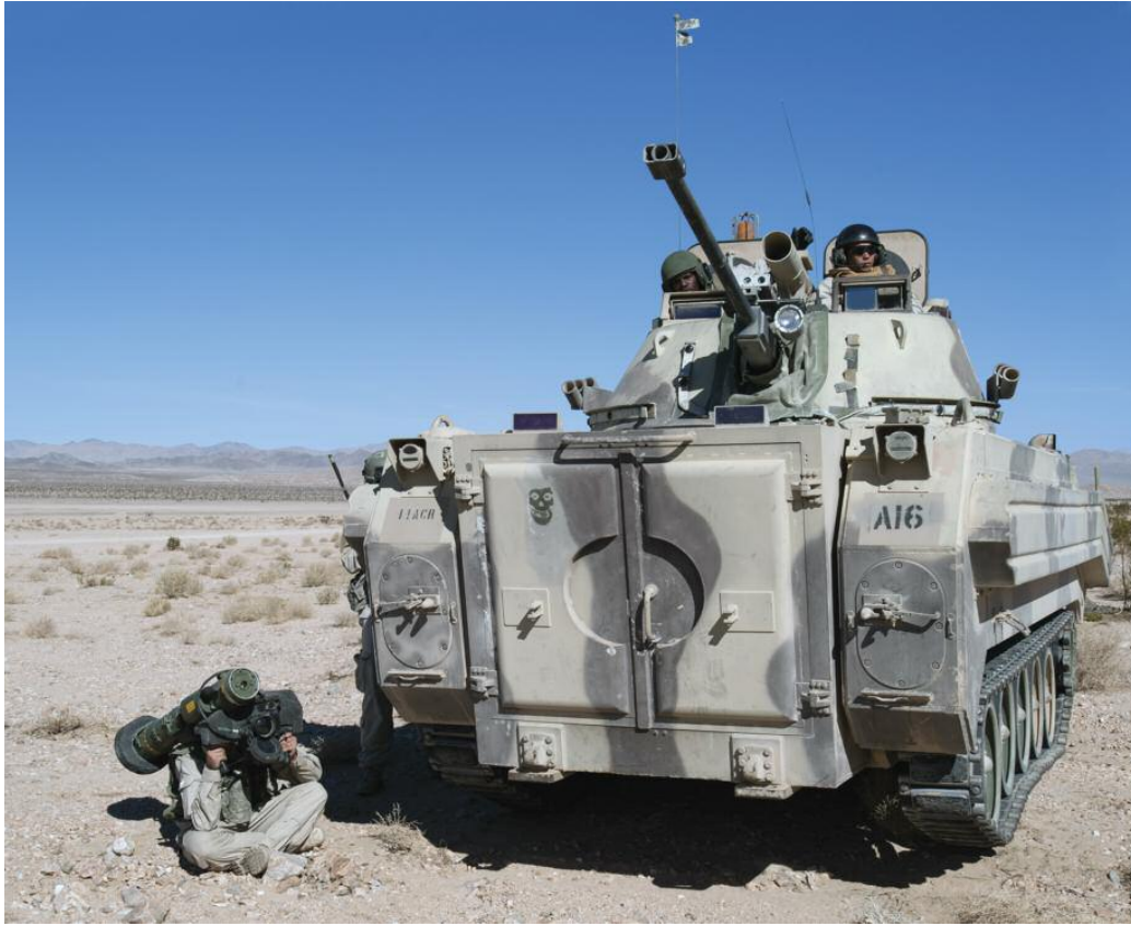
Left, an OPFOR Javelin gunner takes aim at Blue Force vehicles during the opening stages of decisive-action training at NTC. Bottom left, an OTM holds his so-called “god gun” at the ready. The pistol-shaped instrument can be used to inflict a hit on vehicle or individual soldier sensors if the OTM decides it is warranted, and it can also be used to resurrect a soldier or vehicle from a previous hit, hence the name.