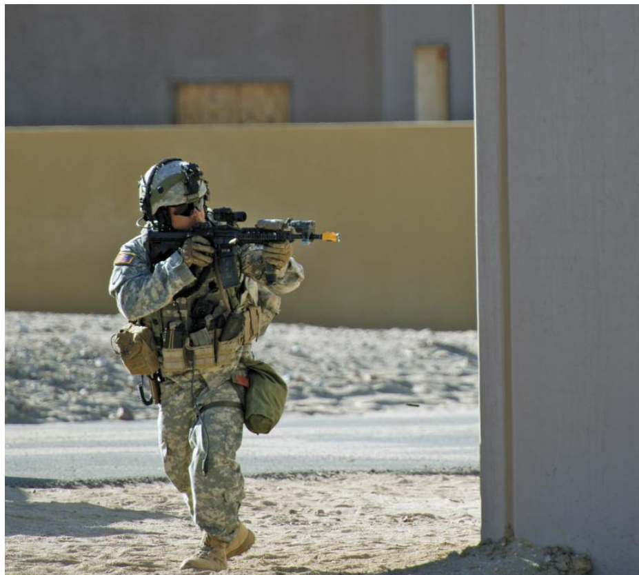
A 1-22 Infantry soldier aims into a doorway as he moves during decisive-action training.

The environment is complex; the threat is complex. The rotational unit has to deal