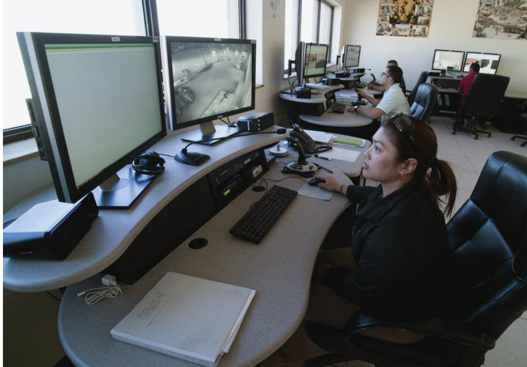
Left, technicians monitor video and other sensor feeds from a control center overlooking the National Urban Warfare Center. The National Urban Warfare Center is a city of more than 300 training buildings built in the desert training area of NTC. The city is 90 percent instrumented, and up to 350 day/night cameras can record activity to provide visual feedback for after-action reviews. Below, a 1st Battalion, 66th Armor (1-66 Armor), soldier drags a mock casualty to cover during training. (The soldiers wear an old-pattern chemical suit mix for training purposes.)