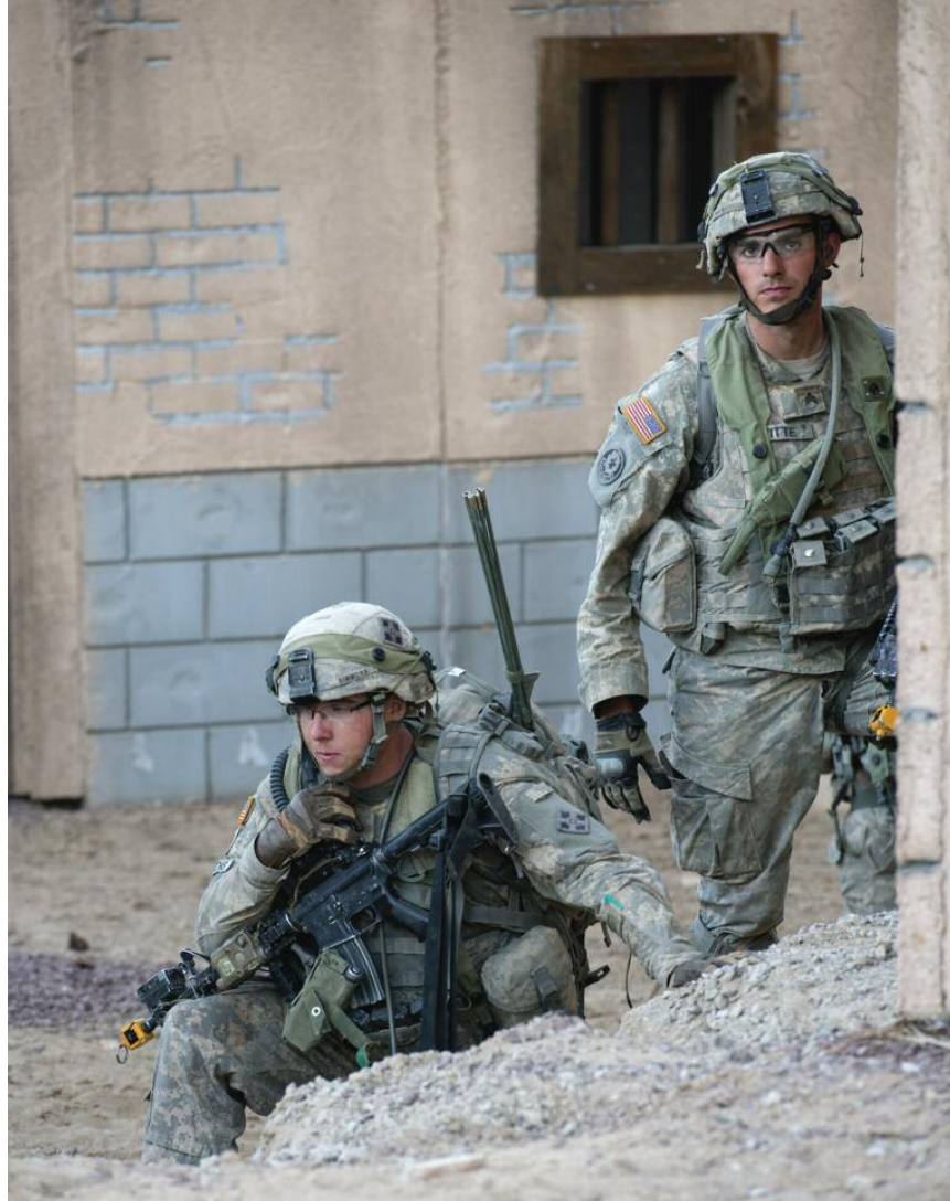
Soldiers from the 1st Battalion, 22nd Infantry (1-22 Infantry) move through an urban combat training village during a training assault.

training effects to do the steering while ensuring the overall safety of the event.