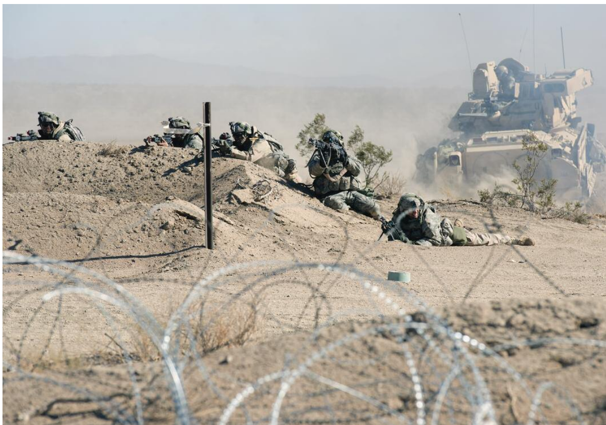
Right, soldiers from 1-66 Armor assault through barriers at NTC during decisive-action training. Bottom right, flame jumps from a training detonation to replicate a rocket-propelled grenade explosion.

Since 9/11, entire towns and villages have been built in the once-empty desert training area to accommodate training for operating in population centers. Some towns have vast tunnel systems running under them to add to the complexity, and technicians can even remotely infuse smells into the tunnels and buildings, ranging from freshly baked bread to sewage, to add to the realism.