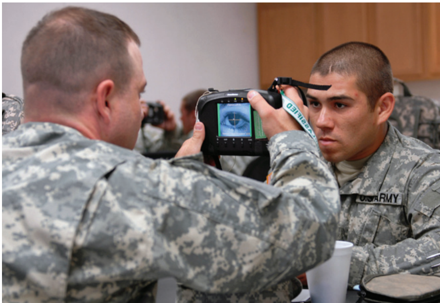
DoD Biometrics—an iris scan

DoD Biometrics designs, engineers, acquires, deploys and sustains enterprise biometric solutions in multiple operating environments, enabling identity dominance on the battlefield and across the services. DoD Biometrics' systems capture, transmit, store, manage, share, retrieve and display biometric data for timely identification or identity verification. These systems are mission enablers for force protection, intelligence, physical and logical access control, identity management/credentialing, de-