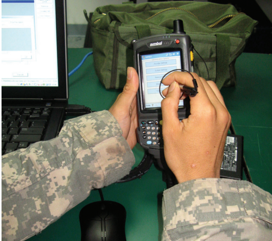
Medical Communications for Combat Casualty Care (MC4) system

Medical Communications for Combat Casualty Care (MC4) integrates, fields and supports a comprehensive medical information system, enabling lifelong electronic medical records, streamlined medical logistics and enhanced situational awareness for Army operational forces. MC4's vision is to be the premier enabler for improved tactical health care and better decision making through the power of IT. MC4 is a ruggedized system of systems containing medical software packages fielded to operational medical forces worldwide. MC4 provides the tools to digitally record and transfer critical medical data from the fox-hole to medical treatment facilities worldwide. Deployable medical forces use the MC4 system to gain quick, accurate access to patient histories and forward casualty resuscitation information, as well as to deliver health-care services remotely through MC4 telehealth capabilities. Combatant commanders use the MC4 system to access medical surveillance information, resulting in enhanced medical situational awareness. Most importantly, MC4 is helping deployed servicemembers. By equipping deployed medical units with automated resources, MC4 helps ensure that