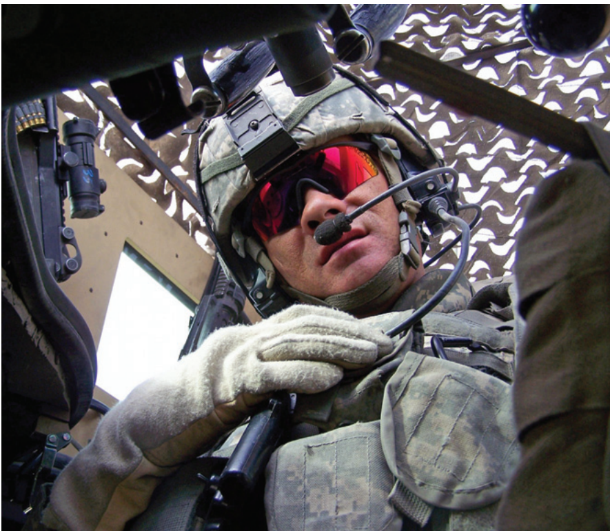
Vehicular Intercom System (VIS)

Enterprise Management Decision Support (EMDS) enables the Department of the Army to achieve faster and more confident enterprise management decision support by retrieving and integrating disparate data to create a common access point for holistic and detailed Army operating force data to enhance understanding and decision making. EMDS is a Secret Internet Protocol Router Network-based, Web-enabled enterprise solution that provides integrated data from multiple authoritative data sources to present a common operating picture for units progressing through the Army force generation (ARFORGEN) cycle. Sponsored by the U.S. Army G-3/5/7, EMDS provides an ARFORGEN common operating picture and, soon, a force management common operating picture to support the Army's global force management process of synchronizing, planning, sourcing, resourcing and executing unit and force deployments.