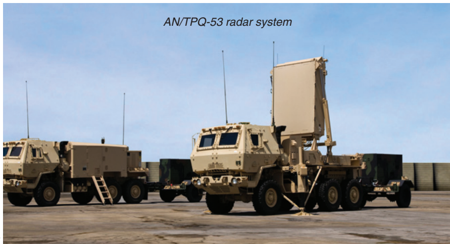
AN/TPQ-53 radar system