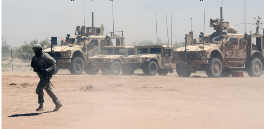
Capability Set 13 tested, validated and finalized during Network Integration Evaluation 12.2 at White Sands Missile Range, N.M., the first integrated package of tactical communications gear.

The centerpiece of CS 13 is Warfighter Information Network-Tactical (WIN-T) Increment 2, a major upgrade to the Army's tactical communications backbone that introduces mission command on-the-move and extends satellite communications to the company level. CS 13 will also deliver unprecedented connectivity to the dismounted soldier through the JTRS Rifleman Radio, a 2-pound radio carried by platoon-, squad- and team-level soldiers for voice communications that also links with handheld devices to transmit text messages, global positioning system (GPS) locations and other data. These devices, known as Nett Warrior (see Individual Equipment listings), act as a smartphone-like mission command system that connects to the Rifleman Radio to provide dismounted leaders with position location information (PLI), text messaging and