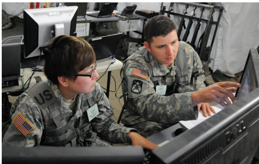
Command Post of the Future (CPOF)

The mission of Program Executive Office Intelligence, Electronic Warfare and Sensors (PEO IEW&S) is to provide affordable, world-class sensor and electronic warfare capabilities, enabling rapid situa-