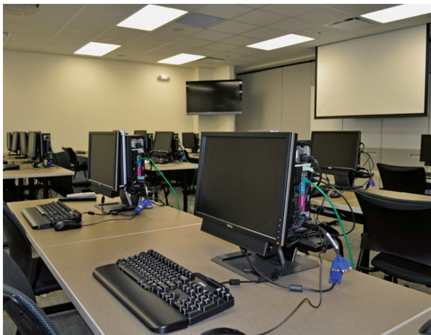
A Logistics Modernization Program (LMP) facility

Land Mobile Radio (LMR) modernizes the Army's continental United States and Pacific nontactical LMR systems in order to support installation public safety organizations and functions. These include first responders, force protection measures and other installation management functions. LMR provides spectrum efficiencies by executing the migration of Army posts, camps and stations to narrowband frequencies as mandated by the National Telecommunica-