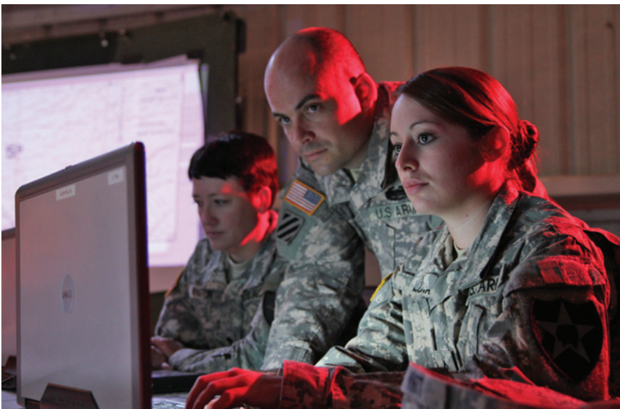
Distributed Common Ground System-Army (DCGS-A) operations

The Machine Foreign Language Translation System (MFLTS) is a software-only program that will develop, acquire, field and sustain a basic automated foreign speech and text translation capability into Army systems of record. The language development design will allow for technical insertion of additional software language modules, performing translation as required by the Army. It is not a device or a set of stand-alone languages; rather, it is a software system that uses a modular open