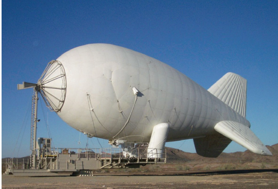
Persistent Threat Detection System (PTDS)

The Persistent Threat Detection System (PTDS) is a quick reaction capability serv-